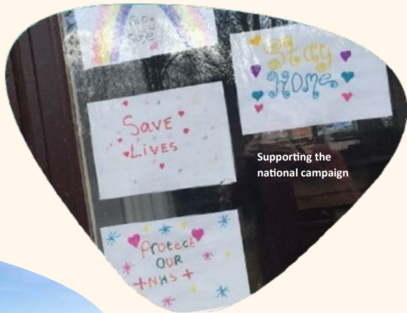
Supporting the national campaign

The Doctors surgery for Amble Cottage is based at the following address: The Lakes Medical Practice, Bridge Lane, Penrith CA11 8HW Tel: 01768 214345