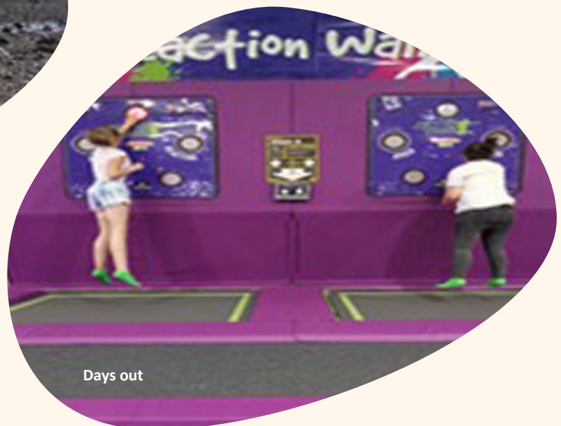
Art by residents