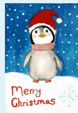
1st place H, Forest View