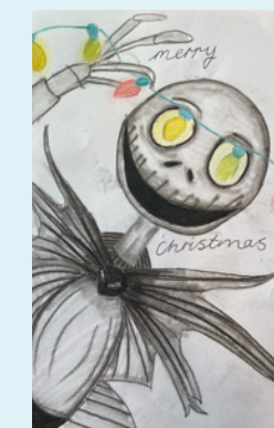
3rd place C, Highview