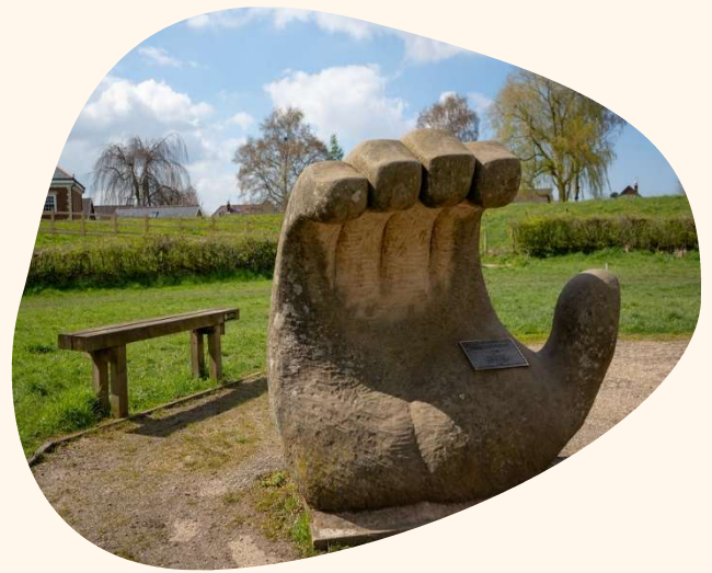
Art by residents

The Dental practice for Carly House is based at the following address: Burns Dentist, 109 Black Bull Lane, Fullwood, Preston, PR2 3QA