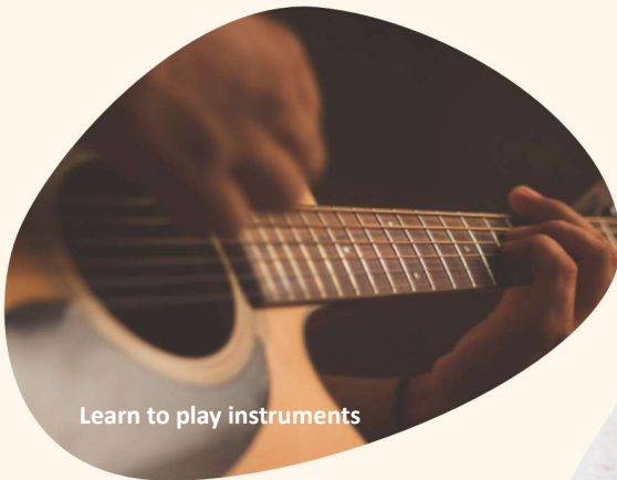
Learn to play instruments

North Leeds Medical Practice, Harrogate Road, Alwoodley, Leeds, West Yorkshire LS17 6PZ Tel: 0113 2680066