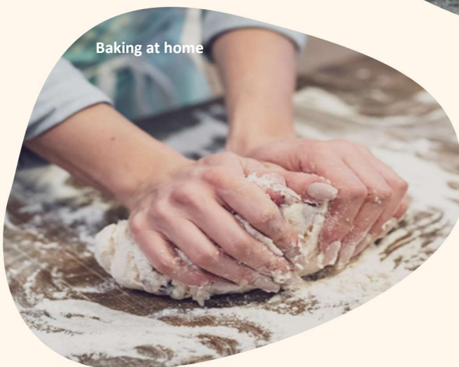
Baking at home