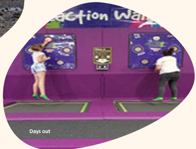
Art by residents