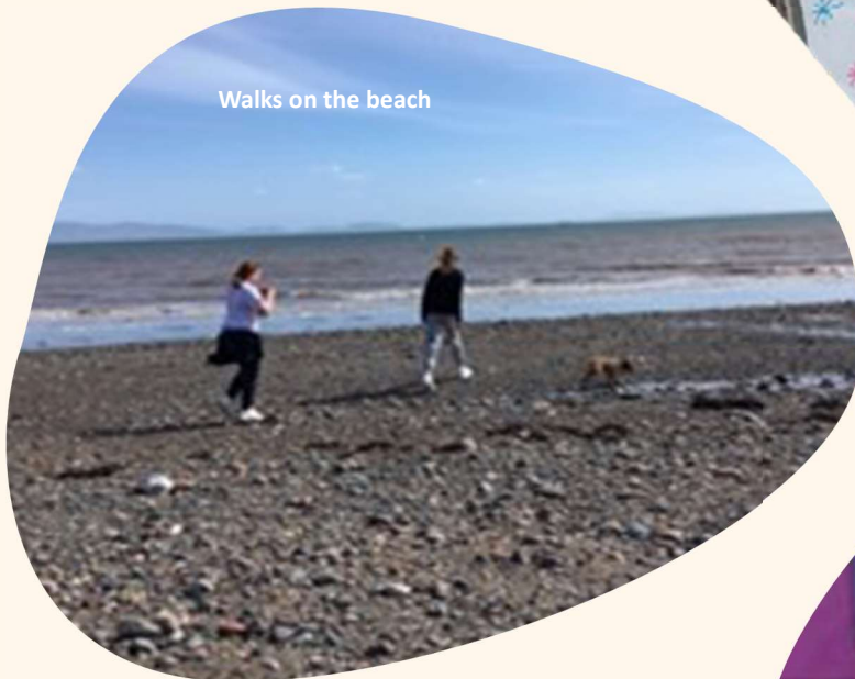
Walks on the beach