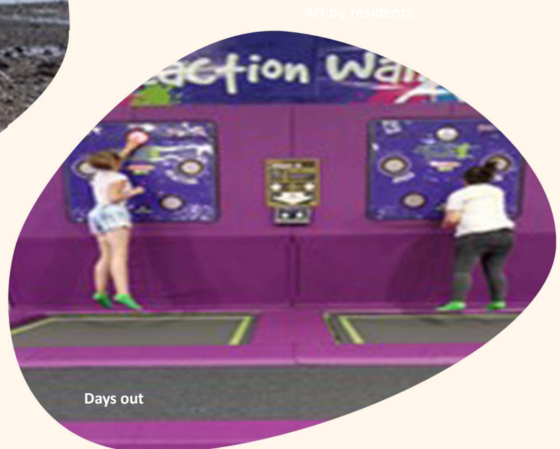
Art by residents