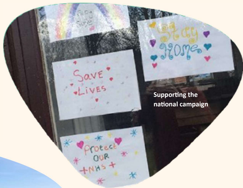
Supporting the national campaign

The Doctors surgery for Amble Cottage is based at the following address: The Lakes Medical Practice, Bridge Lane, Penrith CA11 8HW Tel: 01768 214345